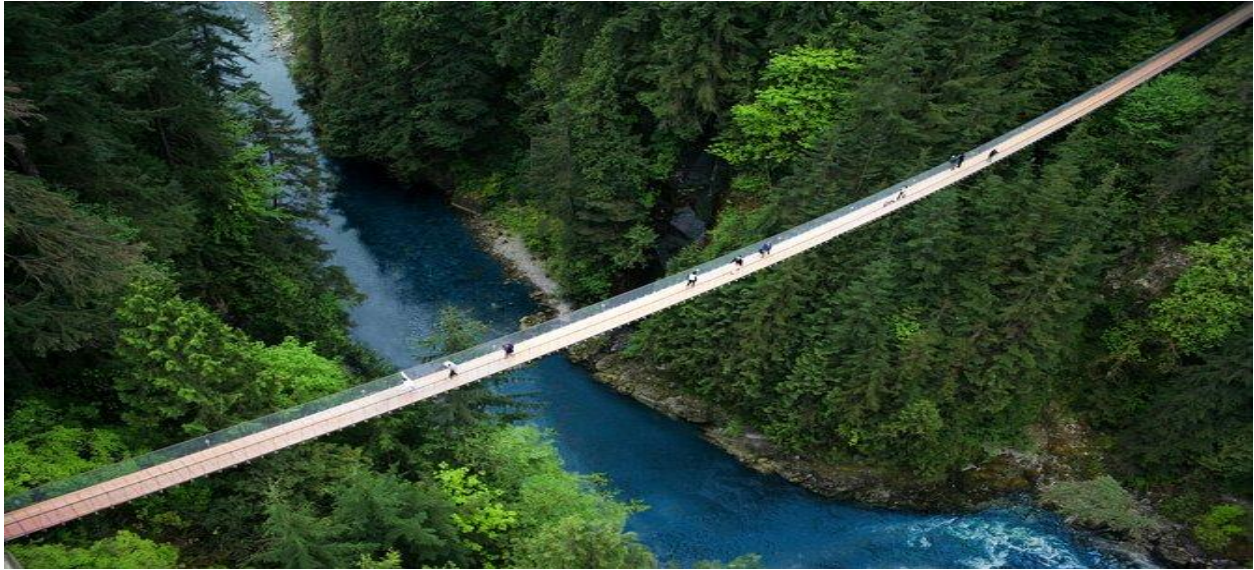
Capilano Suspension Bridge