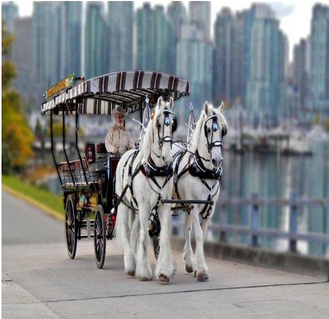
Stanley Park Horse Drawn Tours

* All attraction ticket fees, opening hours and dates are subject to the arrangement of the organizer