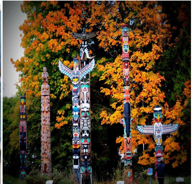
Stanley Park Totem