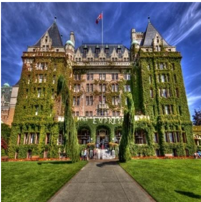
Fairmont Empress Hotel