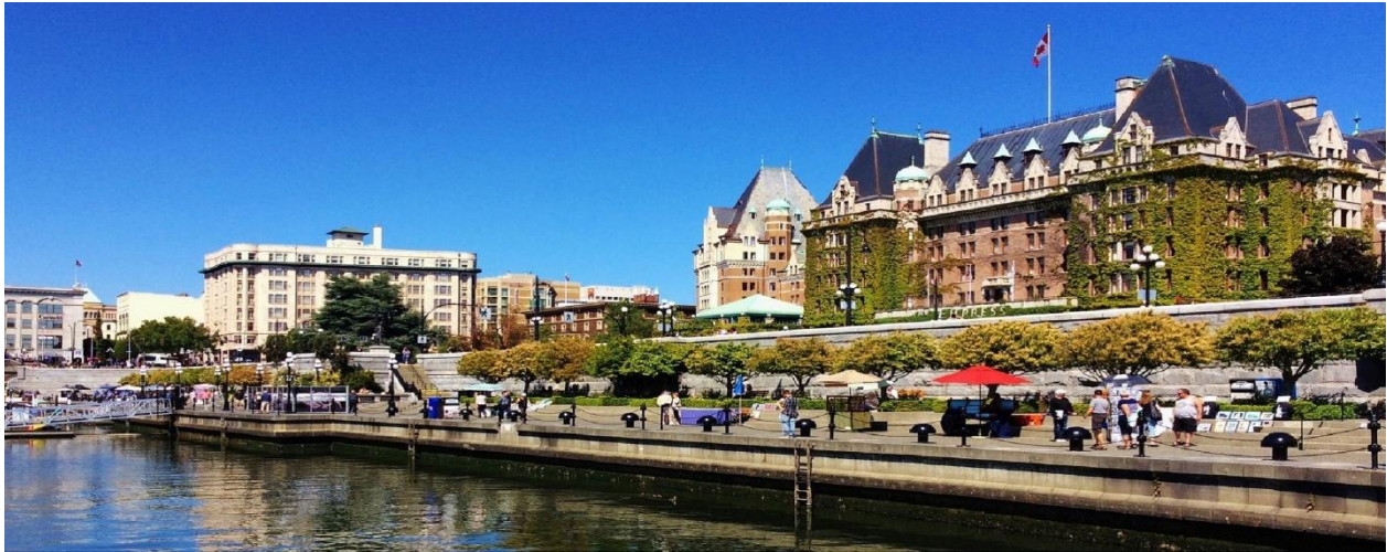
Victor Inner Harbour

☆The reservation and payment for 5 Star Travel's any tour shall be deemed to agree and to be consent to these terms and conditions.